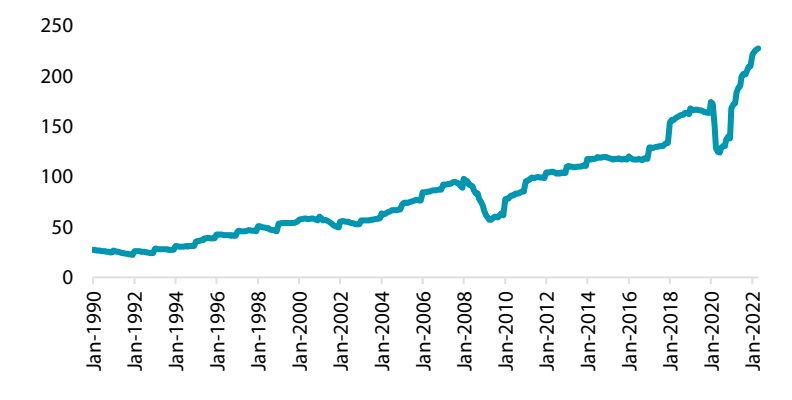
Chart 2: S&P 500 forward earnings (Best EPS)

There is no question that US equities are much more attractive at current levels, but the negative sentiment holding down equities at the moment is the question of future earnings. S&P forward earnings per share is US dollar (USD) 227, up a remarkable +80% from the depths of the pandemic and still a very respectable +30% versus pre-pandemic. Over the long term, earnings naturally grow along with the economy, subject to mean reversion based on placement in the economic cycle.