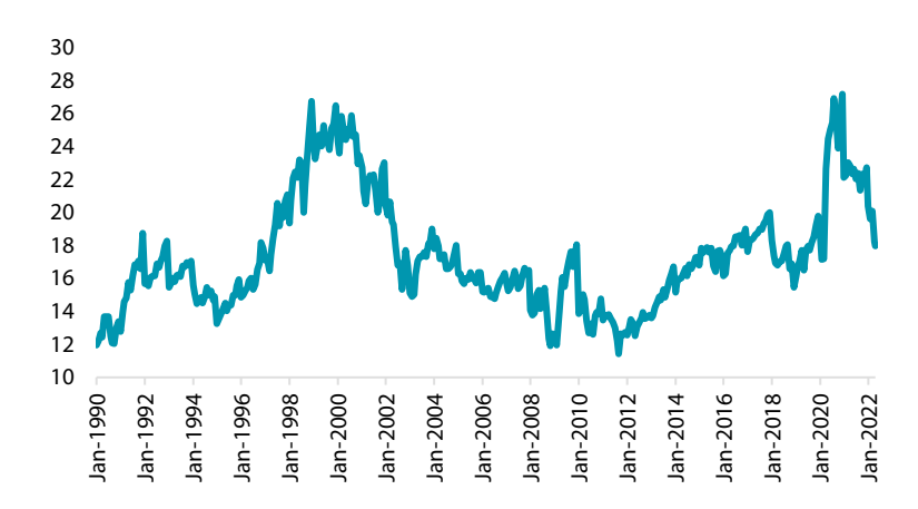
Chart 1: S&P 500 forward PE Ratio (Best P/E Ratio)

At the end of the day, equity prices are driven by earnings and valuations, the latter of which have corrected quite significantly since early in the year, currently at 18x, down from 27x as measured by the price to 12-month forward earnings (Forward PE), which is close to the 17.3x average back in 1990 and around where valuations stood prepandemic.