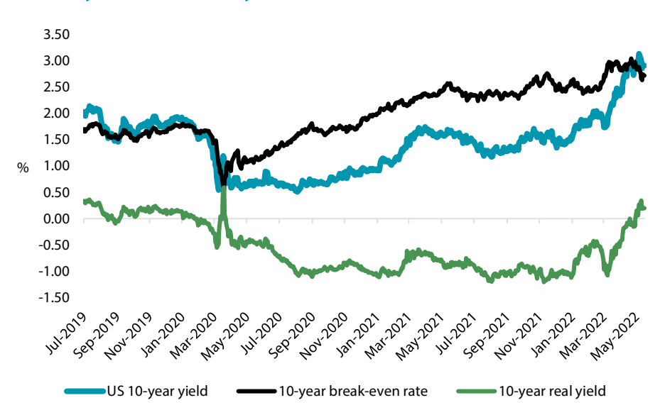
Chart 3: 10-year US Treasuries yields

Fixed income markets have been, to say the least, disappointing for investors so far in 2022. They have failed to provide positive returns befitting an income-style investment and have failed to provide a positive offset to falling equities markets. Asset allocators have become accustomed to nice, stable returns from US Treasuries over the last 30 years, with only five negative years and no back-to-back losing years over that period. Last year was one of those negative years and we now find ourselves with a strong chance of breaking that run with consecutive losses in 2021 and 2022.