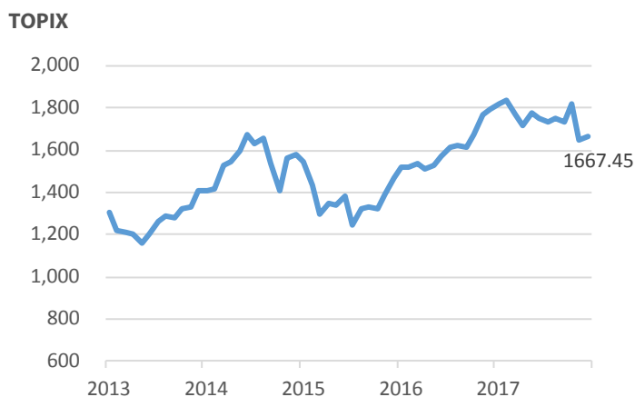
Exhibit 3: Major Market Indices

Source: Bloomberg, as at 30 November 2018