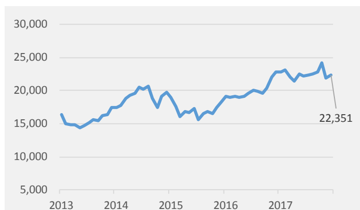
Exhibit 2: Nikkei 225

Source: Bloomberg, as at 30 November 2018