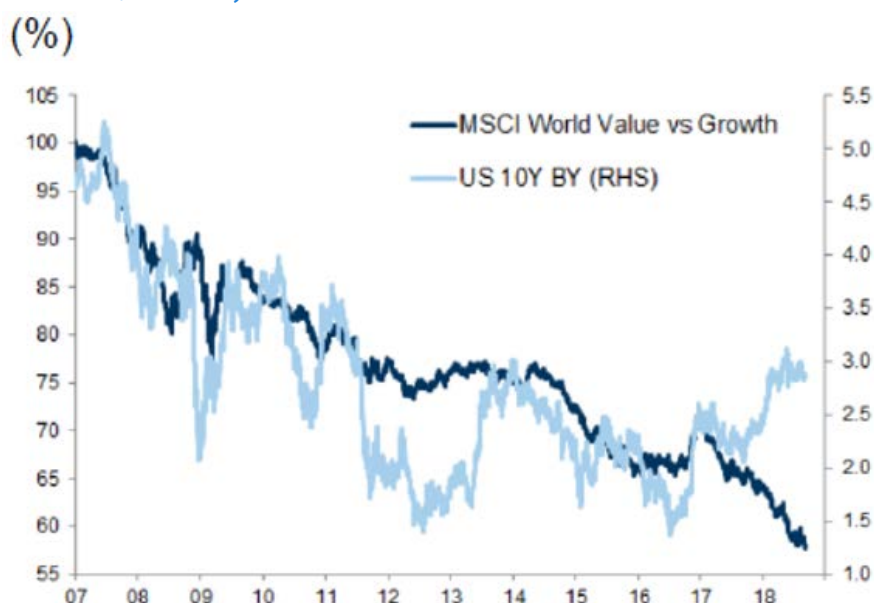
Chart 1 MSCI World Value vs Growth, US bond yields