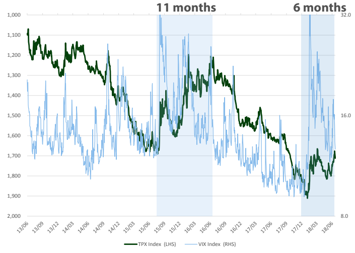
Exhibit 1: VIX vs TOPIX

(As of July 2018), (Note: LHS axis is reversed)