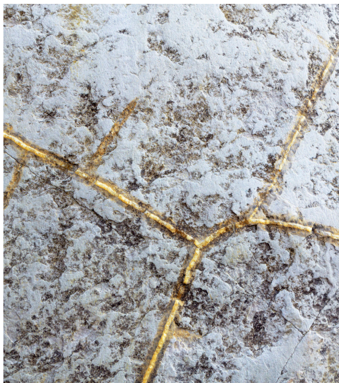
Image: Detail of the stone structure, Moeraki Boulder, Moeraki Beach, Hampden, Otago Region, NZ.