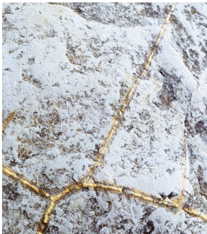
Image: Detail of the stone structure, Moeraki Boulder, Moeraki Beach, Hampden, Otago Region, NZ.