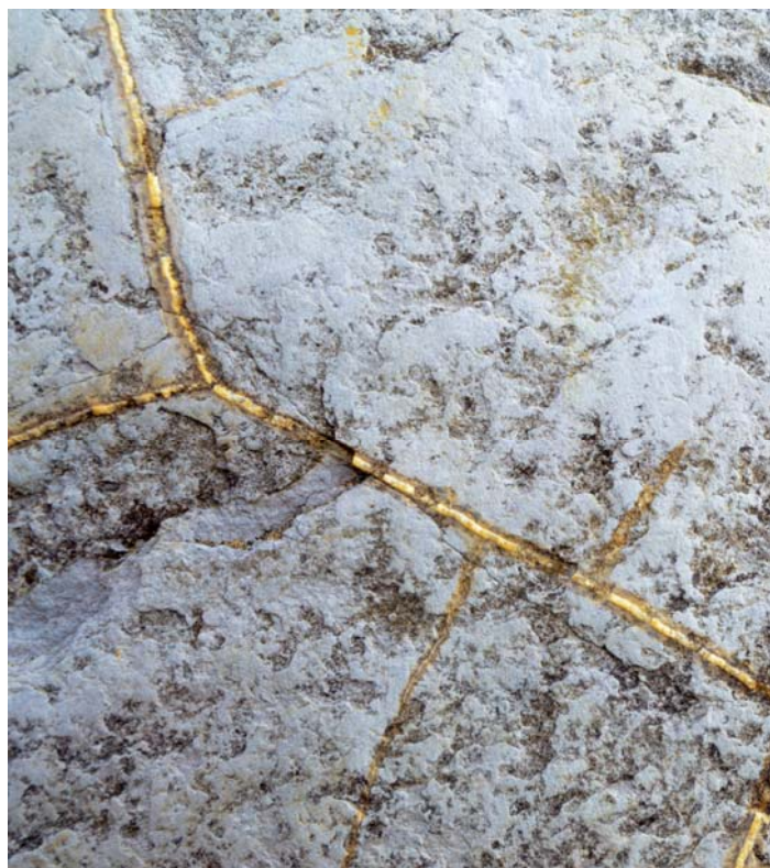
Image: Detail of the stone structure, Moeraki Boulder, Moeraki Beach, Hampden, Otago Region, NZ.