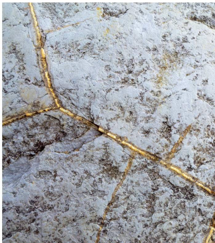
Image: Detail of the stone structure, Moeraki Boulder, Moeraki Beach, Hampden, Otago Region, NZ.