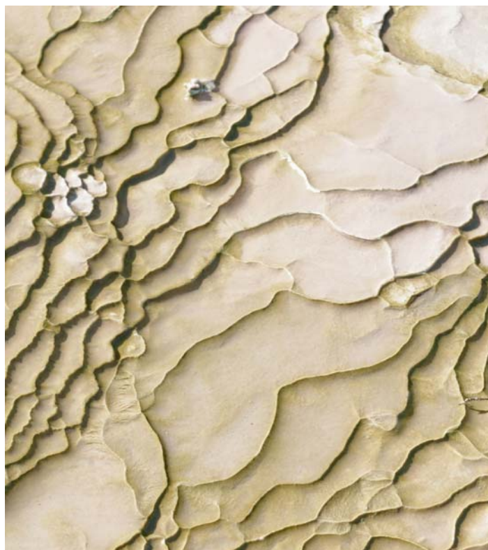
Image: Water eroding rocks, Waiotapu Thermal Area, Rotorua, NZ.