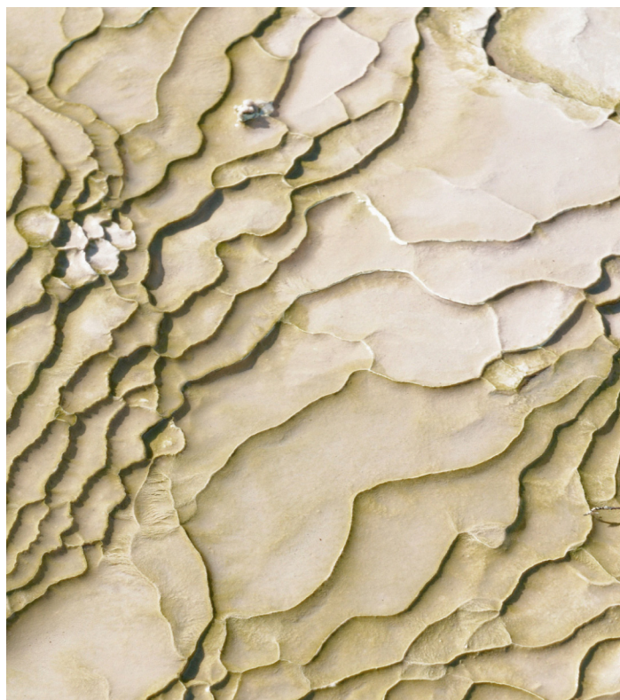
Image: Water eroding rocks, Waiotapu Thermal Area, Rotorua, NZ.