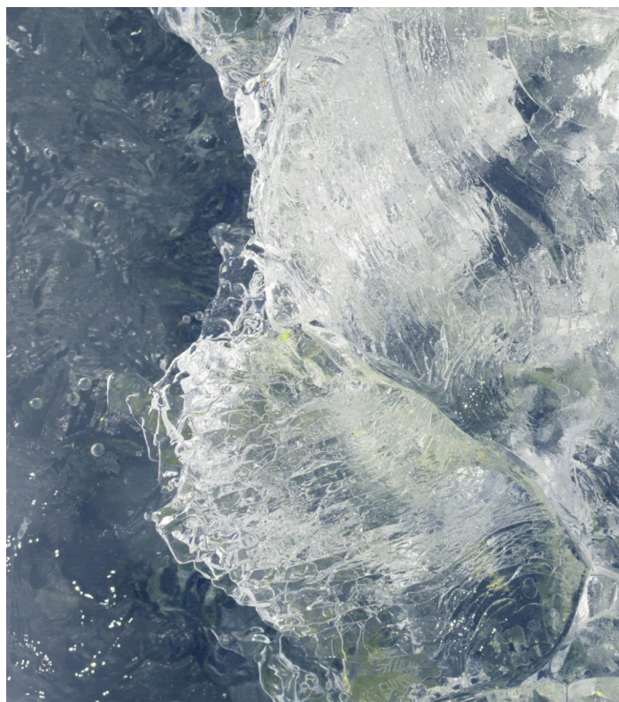
Image: Melting ice from iceberg, Mount Cook, South Island, NZ.