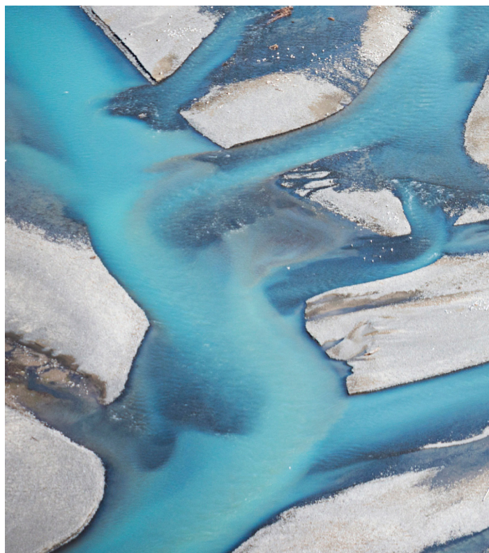
Image: Abstract aerial view of river bed, Canterbury Plains, Christchurch, NZ.