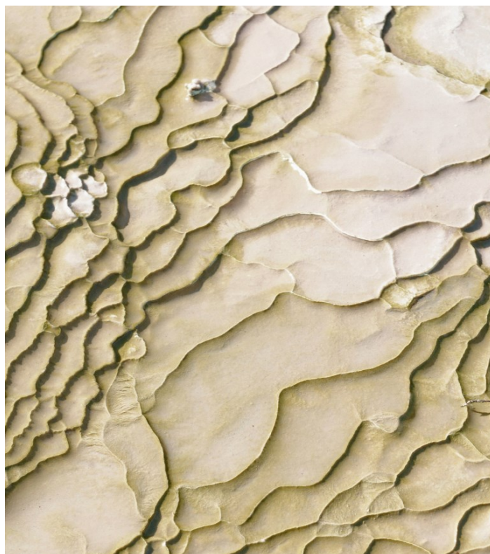
Image: Water eroding rocks, Waiotapu Thermal Area, Rotorua, NZ.