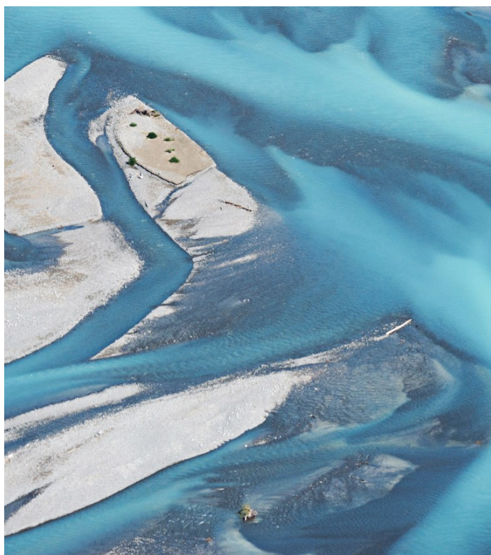
Image: Abstract aerial view of river bed, Canterbury Plains, Christchurch, NZ.