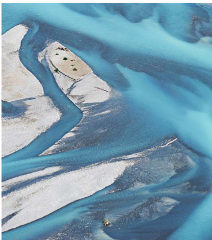
Image: Abstract aerial view of river bed, Canterbury Plains, Christchurch, NZ.