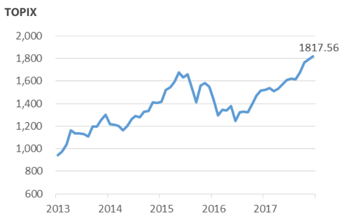
Exhibit 3: Major Market Indices