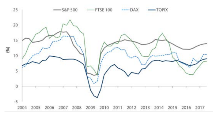
Exhibit 2: ROE comparison (1Q 2004 - 1Q 2017)

At this stage, a reasonable average medium-term ROE target is 12%, which is also the long-term average for European and US companies. However, in our view, Japanese corporates have not done enough to head toward that target, with the exception of noteworthy recent efforts of small and medium-sized companies.