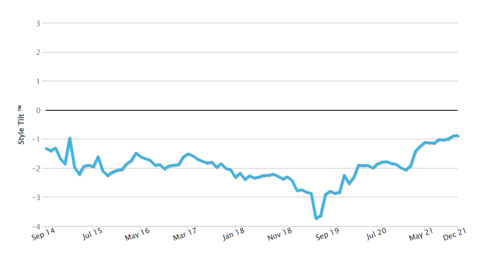
Chart 1: Cash Flow Yield