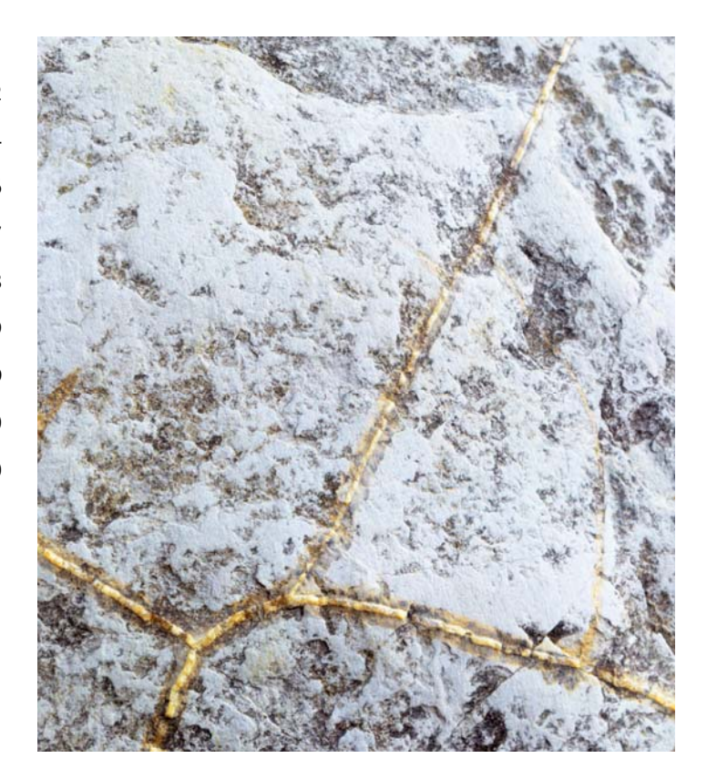
Image: Detail of the stone structure, Moeraki Boulder, Moeraki Beach, Hampden, Otago Region, NZ.