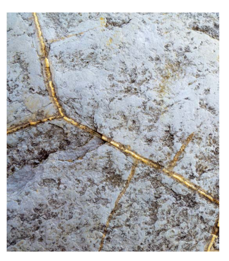
Image: Detail of the stone structure, Moeraki Boulder, Moeraki Beach, Hampden, Otago Region, NZ.