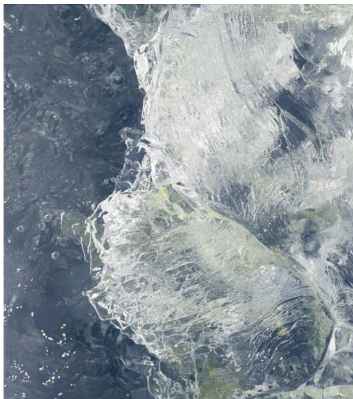
Image: Melting ice from iceberg, Mount Cook, South Island, NZ.