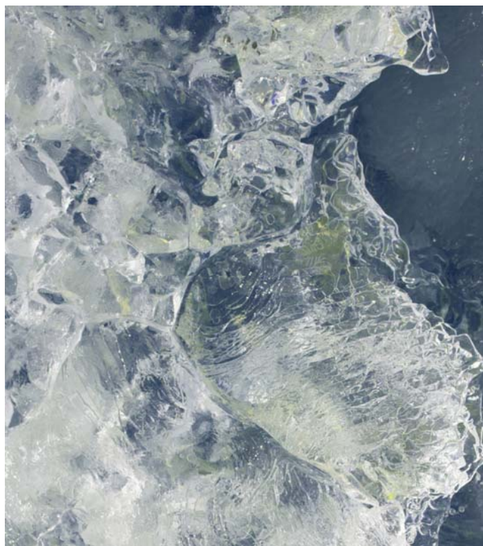
Image: Melting ice from iceberg, Mount Cook, South Island, NZ.